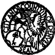
WELLINGTON E. WEBB Mayor